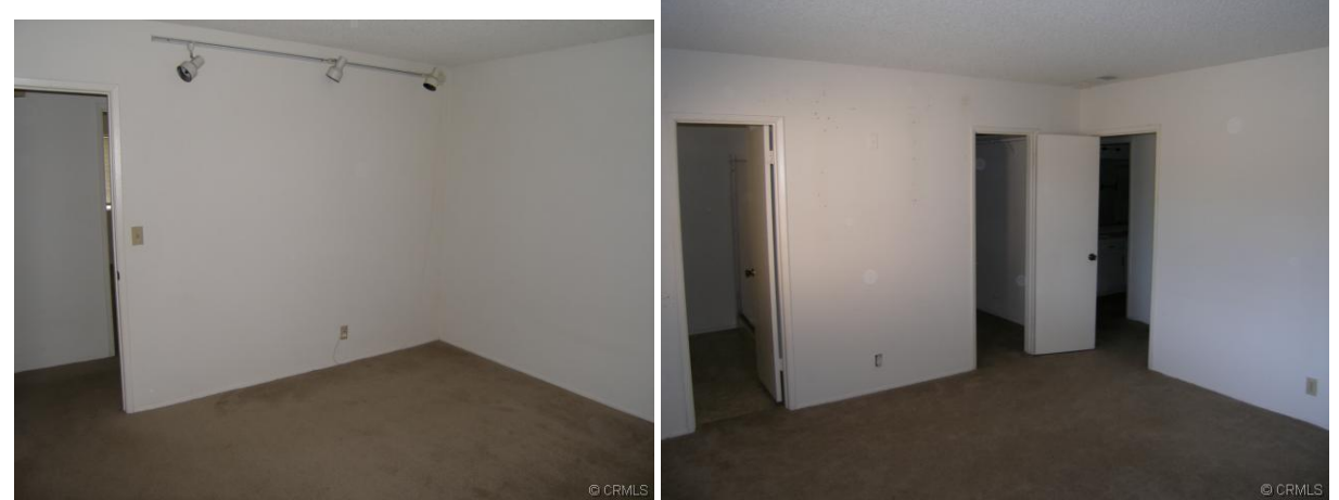
2 of the bedrooms