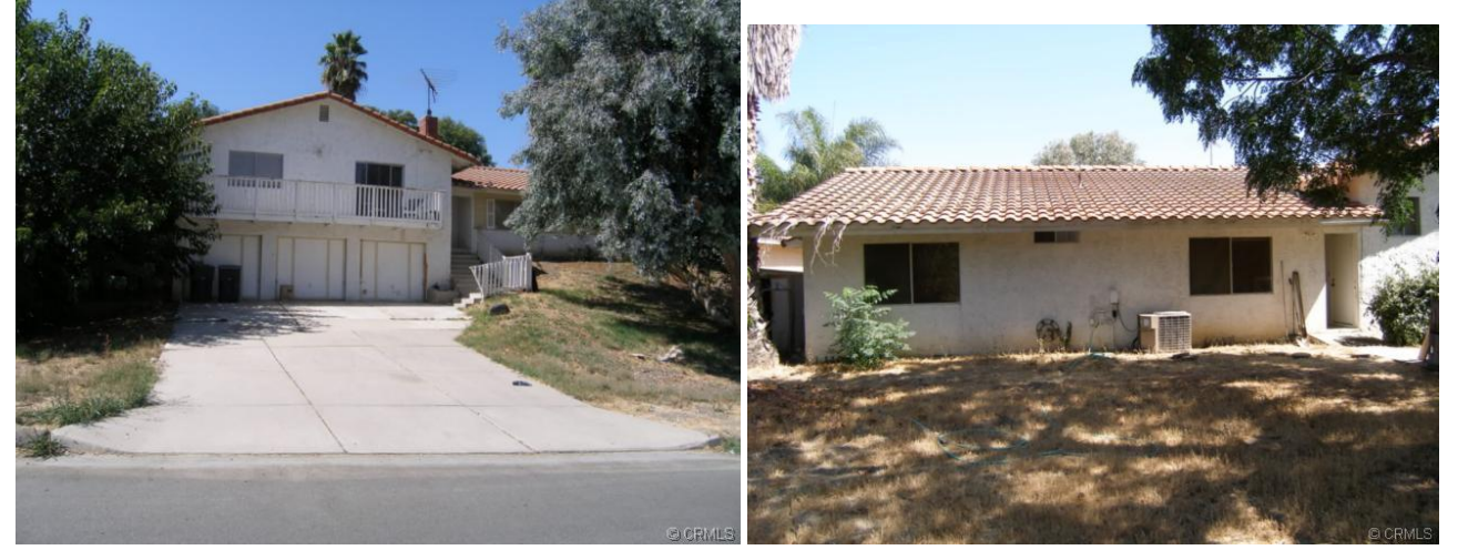
Front of house as is now

When we walk through a property, we are very thorough, but realize that there may be something we missed. Enclosed with this prospectus is a full overview of work we will complete. We add 12% cushion to the repair costs for a buffer in case other items come up. We have gotten 2 estimates on the repairs for this house. ($46K & 48K). We are working with companies we have worked with prior to avoid unreliable contractors, and our process of interviewing and researching new contractors is extensive. We make sure to have every detail on paper so there are no confusions into the project of who said what when. Pictures of the property are below: