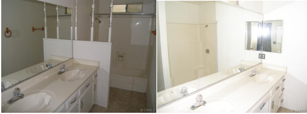
2 of the bathrooms