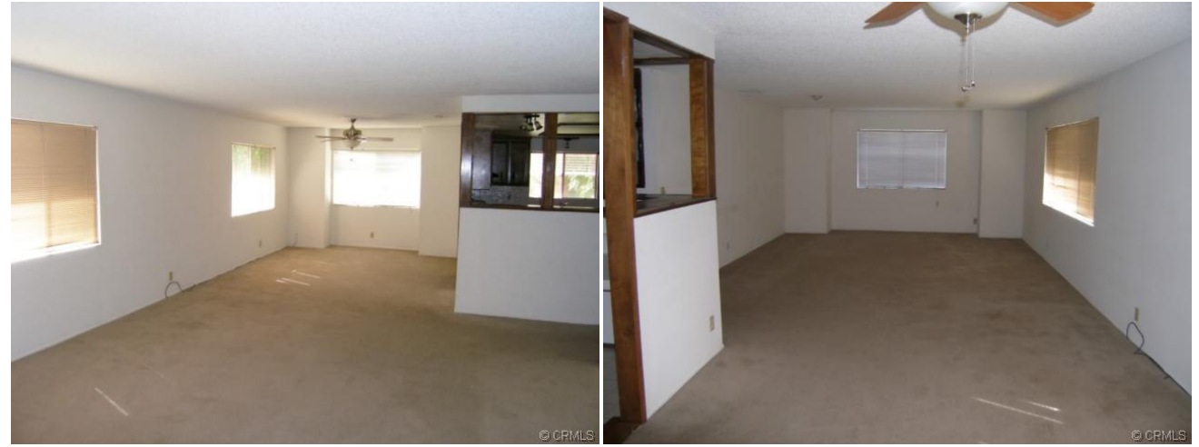
Living room from 2 different angles